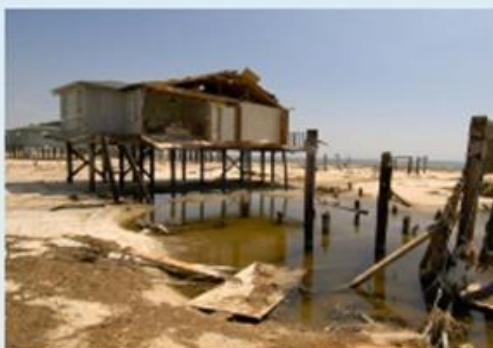
Hurricane Katrina's storm surge destroyed homes and roads on Dauphin Island in 2005.

Whether or not storms become more intense, coastal homes and infrastructure will flood more often as sea level rises, because storm surges will become higher as well. Rising sea level is likely to increase flood insurance rates, while more frequent storms could increase the deductible for wind damage in homeowner insurance policies. Many cities, roads, railways, ports, airports, and oil and gas facilities along the Gulf Coast are vulnerable to the combined impacts of storms and sea level rise. People may move from vulnerable coastal communities and stress the infrastructure of the communities that receive them.