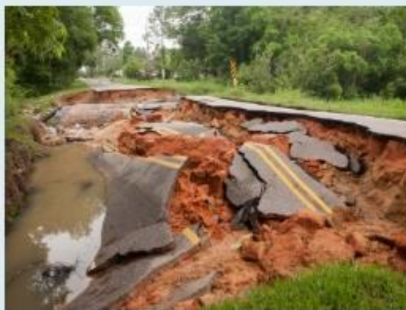
Flooding of a small stream in June 2014 destroyed this roadbed in Foley.

Droughts create a different set of challenges. When reservoirs release water for navigation along the Tennessee or Black Warrior rivers, too little water may be available for lake recreation or hydropower. Low flows from drought occasionally limit navigation along the Alabama River. During severe droughts in the Mississippi River's watershed, however, navigation can potentially increase on the Tennessee-Tombigbee Waterway, which provides an alternative route to the Gulf of Mexico.